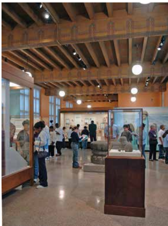
Students working in the galleries after their tour